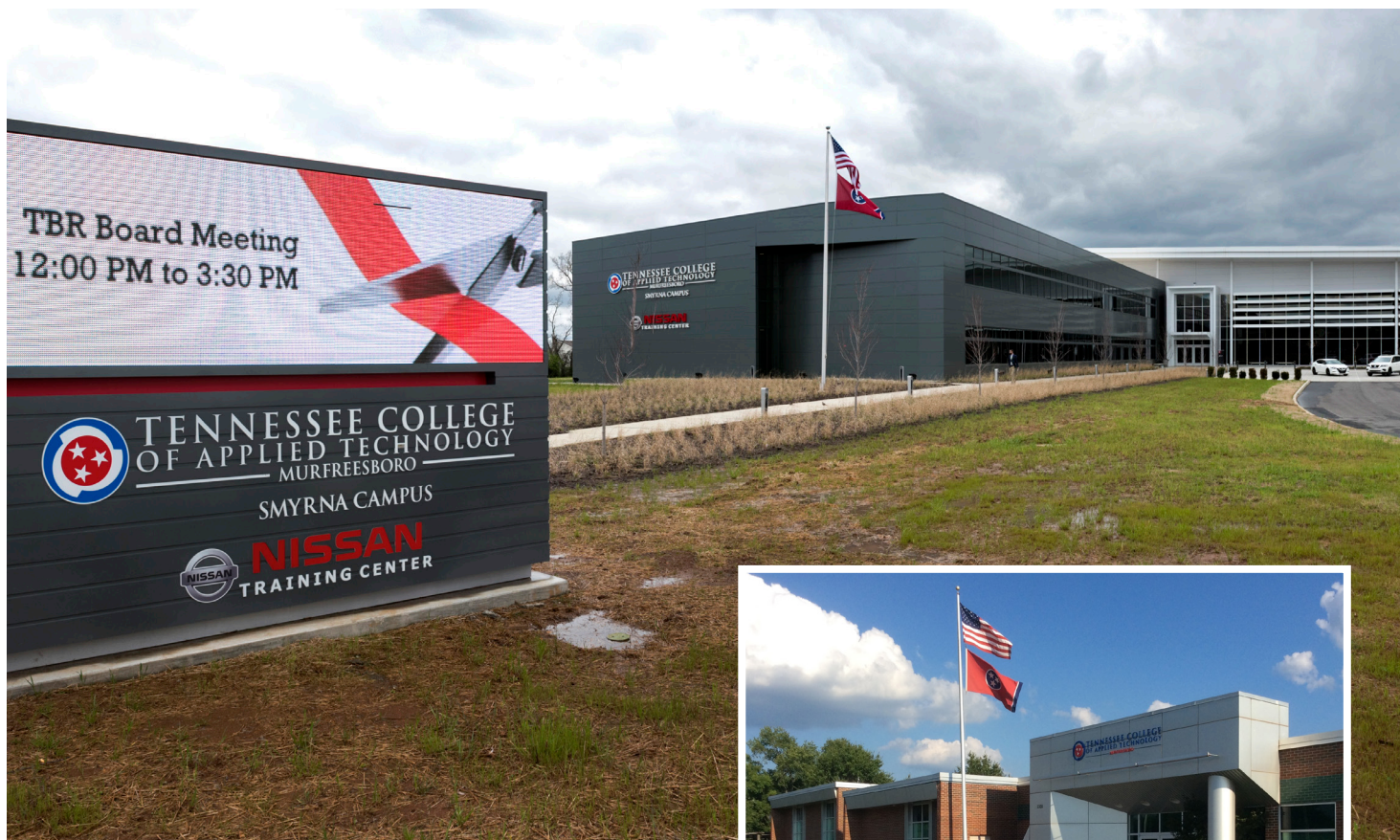
TCAT MURFREESBORO MAIN CAMPUS (right) and Smyrna Campus and Nissan Training Center (above).